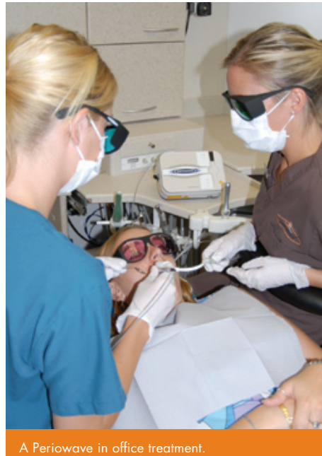
A Periowave in office treatment.

TechTown Dentistry is proud to offer Periowave™ - a revolutionary new technology that treats gum inflammation and infection painlessly. If you have periodontal disease and are facing the prospect of surgery or antibiotics, Periowave™ may be the ideal treatment for you. With the use of a non-thermal laser and photosensitizer solution, Periowave™ treats below-the-gumline problems without surgery, without needles and without pain. It also uses a non-